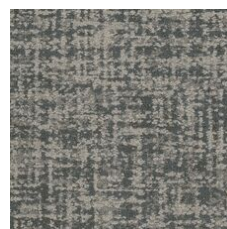
Heritage 85530 LRV 18.1