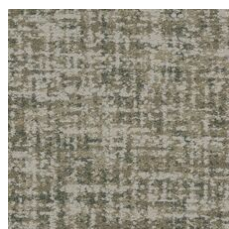
Recollect 85215 LRV 24.8