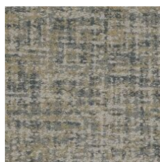
Classic 85496 LRV 22.8