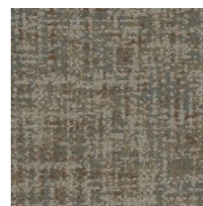
Nostalgic 85665 LRV 17.2