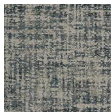
Timeless 85402 LRV 25