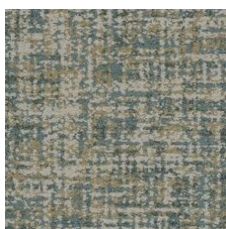
Novelty 85327 LRV 23.4